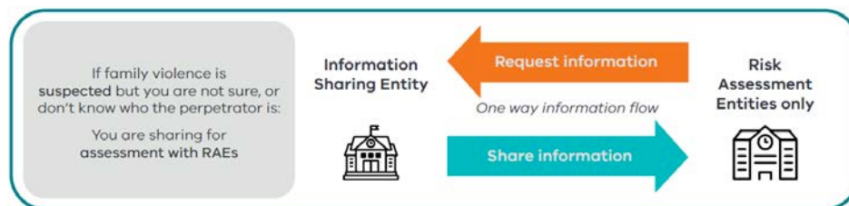
Figure 1: Overview of activities when sharing information for risk assessment

Family violence risk assessment is an ongoing process and is required at different points in time from different service perspectives. Education and care services will have a role in working collaboratively with other services to contribute to ongoing risk assessment and management of family violence.