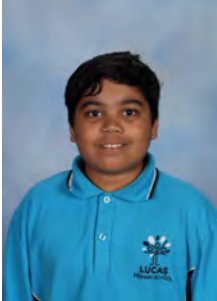
Zul 5/6 B

For always striving to do his best in all areas of his learning. He is a wonderful role model for his peers. A fantastic effort!